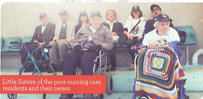
Little Sisters of the poor nursing care residents and their carers